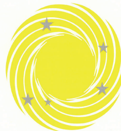
PROJECT DOCC Delivery of Chronic Care